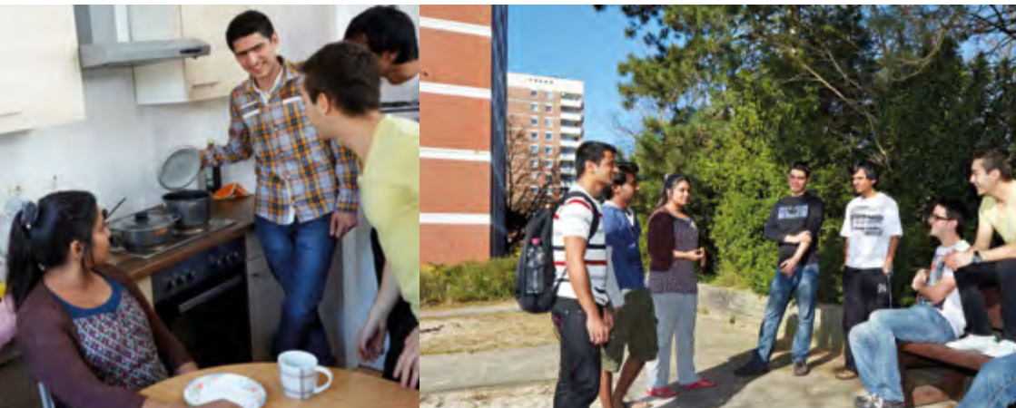
Dormitory in Darmstadt-Eberstadt

We try to consider but cannot guarantee the preferences on the application sheet.