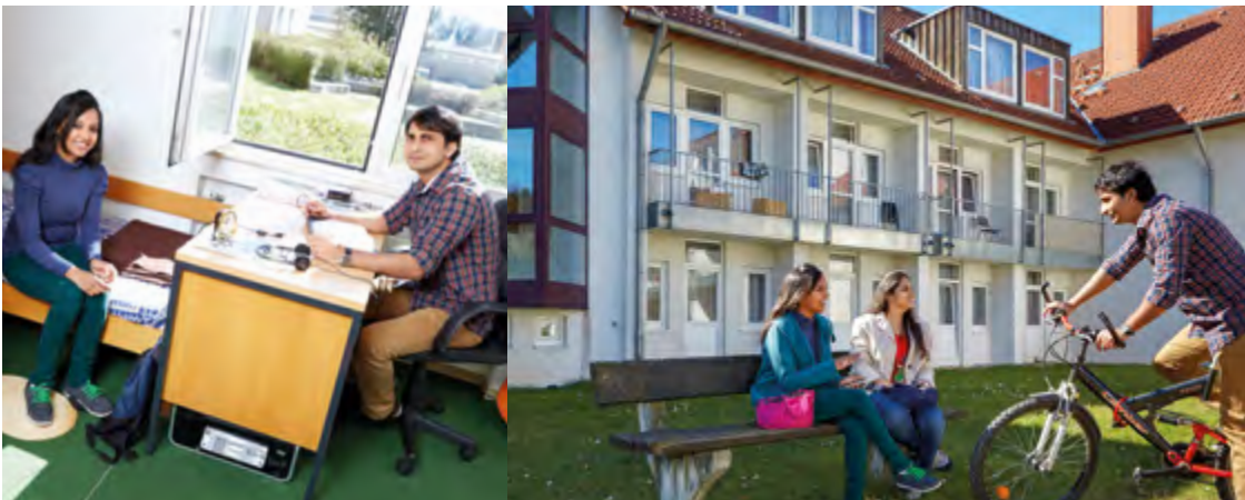
Dormitory in Dieburg

Please note that you can only move in into your accommodation from Monday to Friday during business hours of your housing agency. It is not possible to move in on Saturdays, Sundays and bank holidays. Make sure to book a room in a youth hostel in Darmstadt or Frankfurt well in advance.